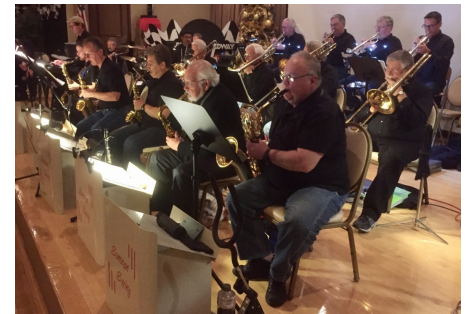
Sonoran Swing Band