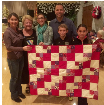
The Groebe family